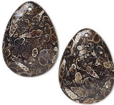
2 shown for variation

Cabochon of the Month for March: Turritella Agate.