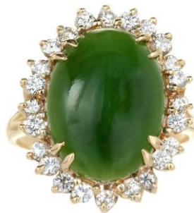
NEPHRITE JADE (image may be enlarged)