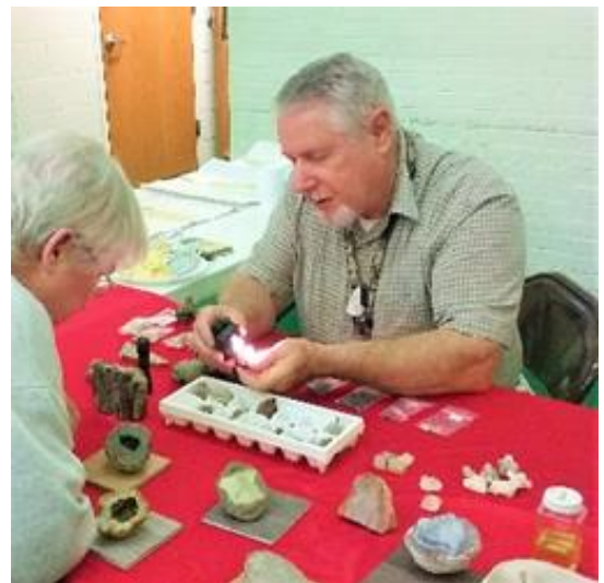
Getting started in Rockhounding is easy...deciding on what to do with your collection is the exciting part.