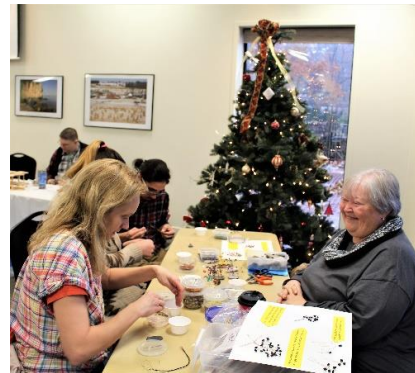
There's nothing like a Gem Tree to put you in the Holiday Spirit.

Make sure the December the Artist building at Botanical That meeting 6:00 pm and having our dinner.