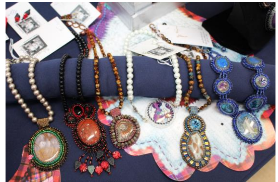
The December Heralding the Holidays show was well attended despite the wet weather.