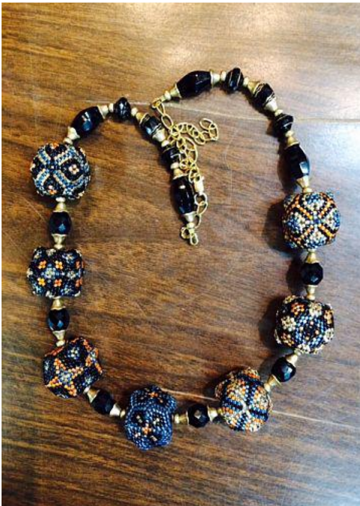
Bracelet by Kathy Hotchkiss

Just make a little hook out of coat hanger wire (or use a screw-in cup hook) and chuck it up in your screw gun. Grip the free ends of the wire in a vice and slip the looped end onto your hook. Keep a little tension on the wires as you twist. Note that a power drill is too fast a tool for this unless you have one with variable speed.