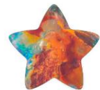
Fire Opal Star

Open to all members of the club, your piece of jewelry is to be of a Patriotic theme : red, white, and blue or a flag, liberty tree, star or some other patriotic symbol. There will be categories or groups. The categories are: Beading, Extreme Beading, Faceting, Gem Crafting, and Metal Crafting. Contestants may enter up to 2 categories, but only those age 17 and under may enter the Juniors. Contestants who enter more than one category, must use a different piece of jewelry for each category. Please leave your entry at the officer's table by 6:50pm the night of the July meeting. Winners will receive a 1st, 2nd and 3rd Place ribbon and a free open work session pass for the best of show (good for two sessions).