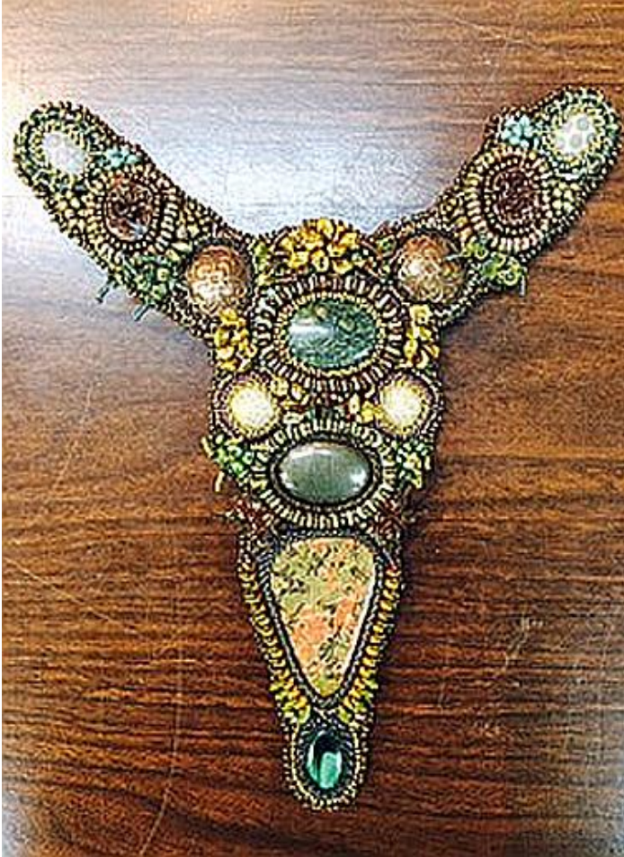
Pendant centerpiece detail