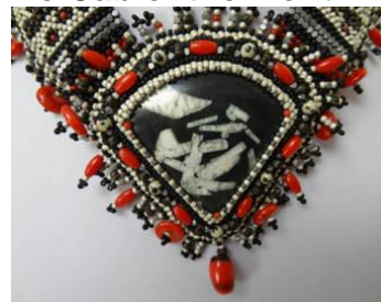
Chinese Writing Stone.