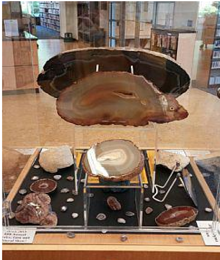
Rosford Library Display