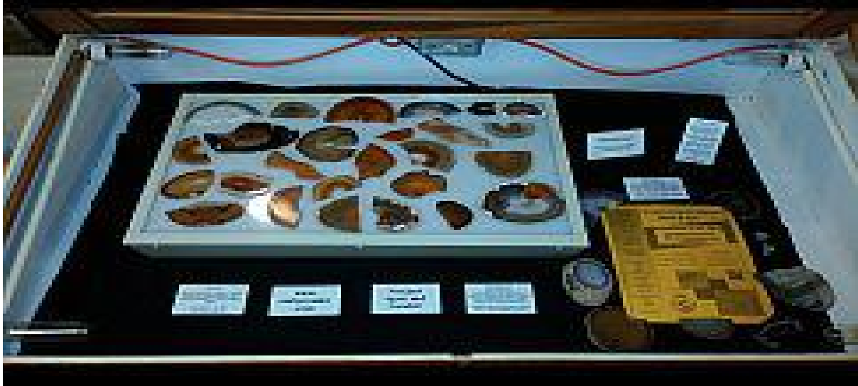
Reynolds Corner Library Display