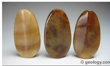
Typical Brazilian Agate Cabbochons

The November Cab of the Month is Brazilian Agate ,