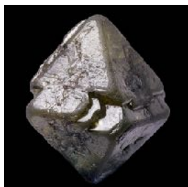
April Gemstone: Diamond (image in the rough)