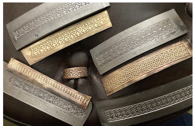
Patterned ring made during "Make a patterned ring band class"