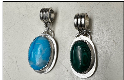
Pendants made during "Make your first pendant class"

Members who wish to attend this session should bring one specimen that is unidentified and or unknown to them. As a group we will be making identification cards as well as attempting to identify everything we can! Come on down from 6PM-8PM on February 10th! Please bring $4 dollars for club fees.